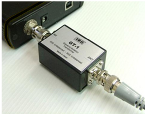
GT-1 connected to a receiver

GT-1 is not effective for suppressing noise not caused by the ground loop effect.